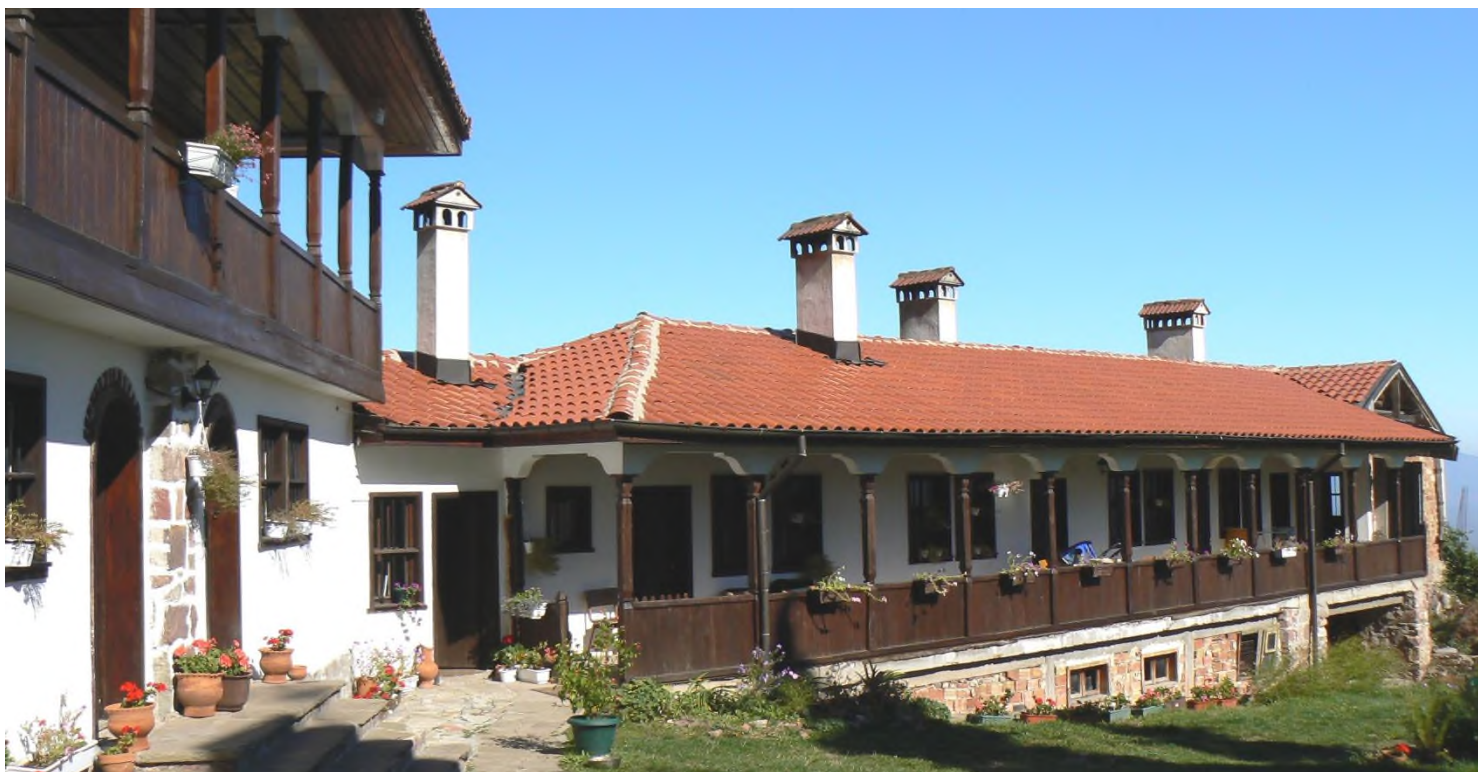
Village of Lozen